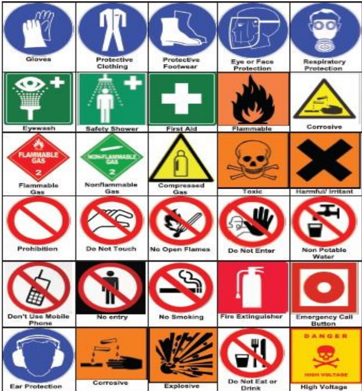
Fig- Commonly used laboratory safety signs