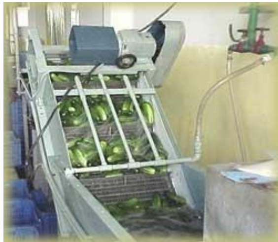
Brushwasher for Gherkins