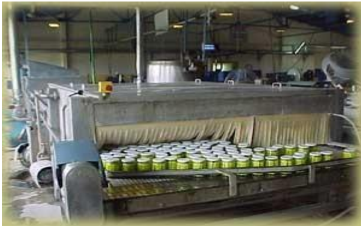
Glass jars entering pasteurization tunnel.

The products packed in glass jars/ cans should be pasteurized at between 80 to 85°C for 12 to 18 min in a pasteurization tunnel. The temperature of processing should be kept under strict control so that a minimum core temperature of 70°C should be obtained for the gherkin. This stage is very crucial as it is done to inhibit/eliminate the viable microbial load (pathogens) and to increase shelf life of product.