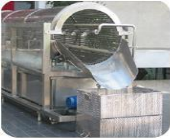
Drum washer for Gherkins